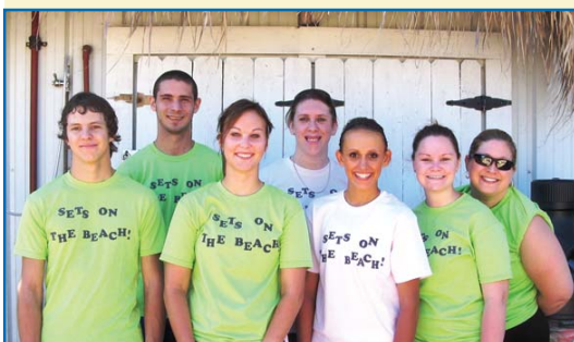
A student team joins us for their second year at the tourney.