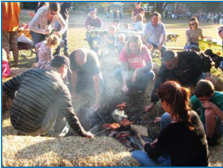
Where there's smoke; there's fire! Folks gather around the bonfire at Vala's Pumpkin Patch to roast hotdogs and make s'mores. Food and drinks were provided compliments of the Alumni Association.