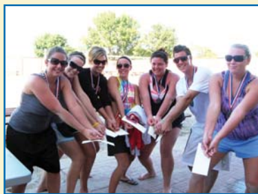
Second Place Recreational: Last But Not Least, a student team