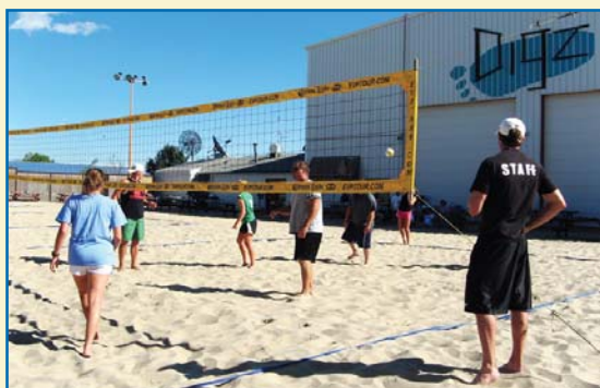
Sixteen teams of alums, students, and friends participated - playing recreational or competitive rules under sunny skies at The Digz in Omaha.