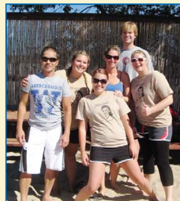
Sonography alumni team