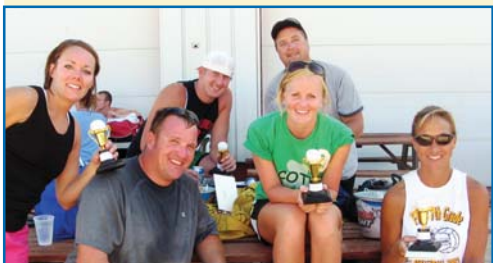
First Place Competitive: Flunkies and Fluzies