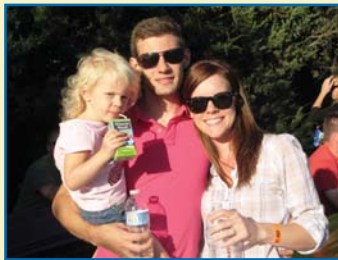
Many students and their families came to join in the fun on the beautiful day of October 5 th .