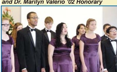
The CHS Singers from Omaha's Central High School provide delightful entertainment.