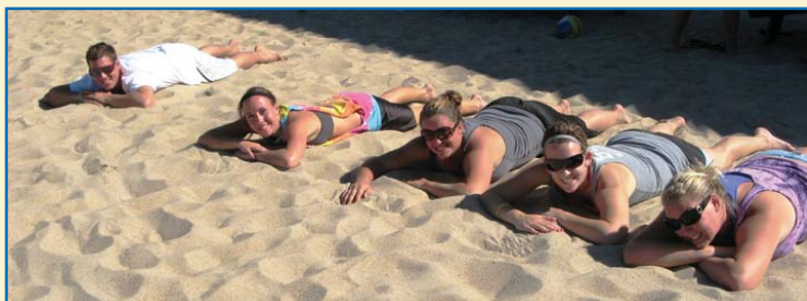
Teammates soak up some sun in the sand while waiting to play.