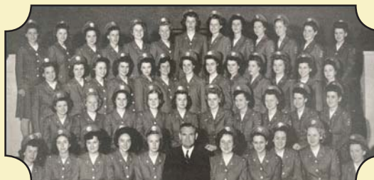
The Nebraska Methodist Cadet Nurse Choir as pictured in the May, 1945 edition of The Probe newsletter