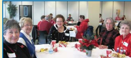
Members of the Class of '56 gather to connect with one another during the holiday season.