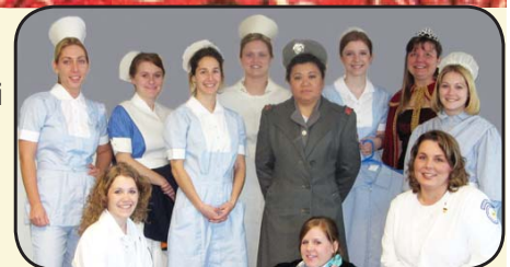
Celebrating 120 years!

The time has come to give special recognition to our graduates who served our country in the U.S. Cadet Nurse Corps!