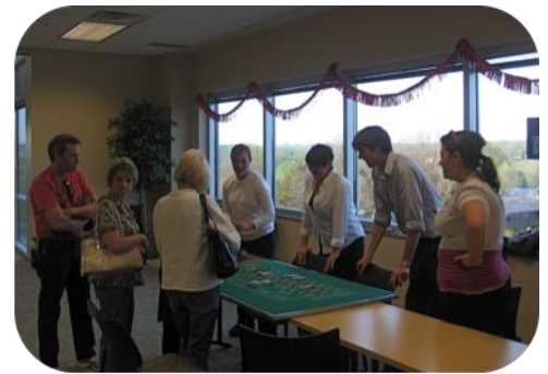
Testing their luck at a game of roulette