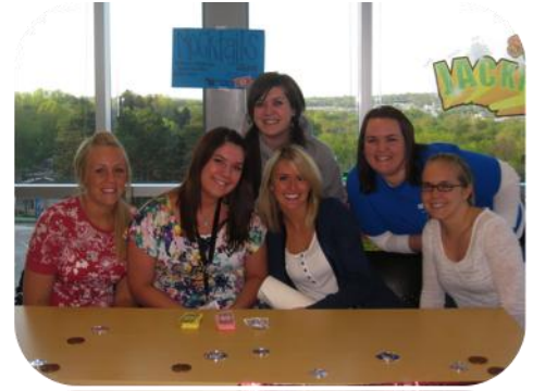
Radiology Techs serving tasty Mock-Tails

The Autism Society of Nebraska provides "a community for those affected by autism in which support is given, questions are answered, and information about schools, doctors, and therapy options can be obtained."